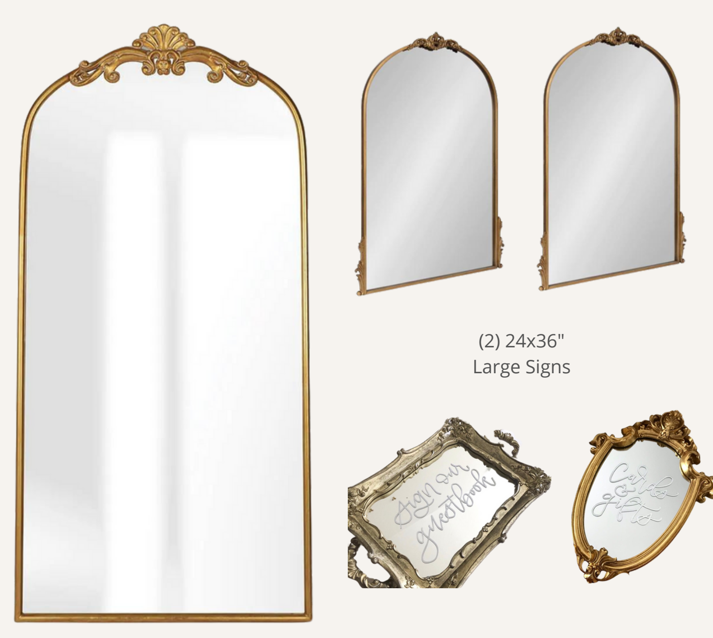
36x72" Extra Large Sign