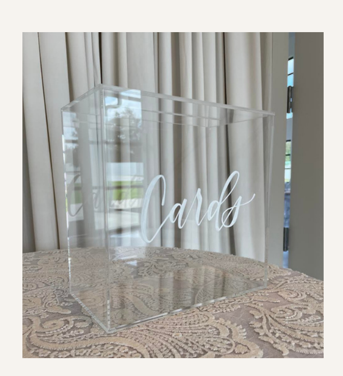
Gold and clear card boxes are $25/each to rent