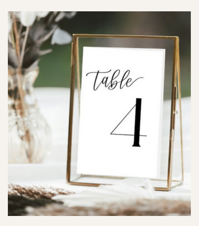
9x7" | Numbers 1-20 | $10/each