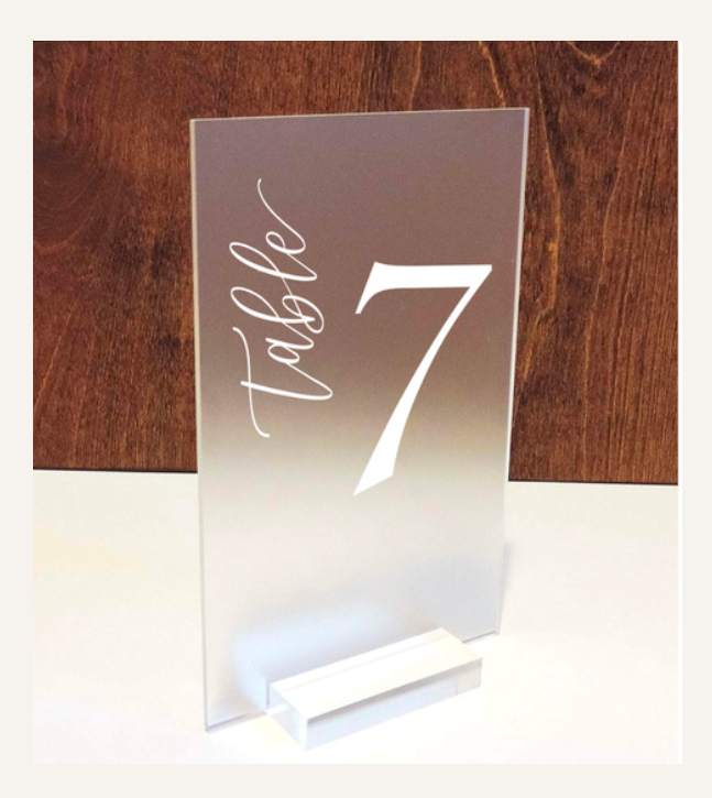
5x7" | Numbers 1-20 | $8/each